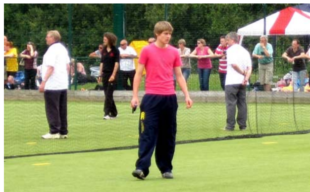
Two young leaders completing their umpire assessment at the North Yorkshire Youth Games

More courses are being planned for the new season so please let us know if you are interested (see Key Contacts on page 5).